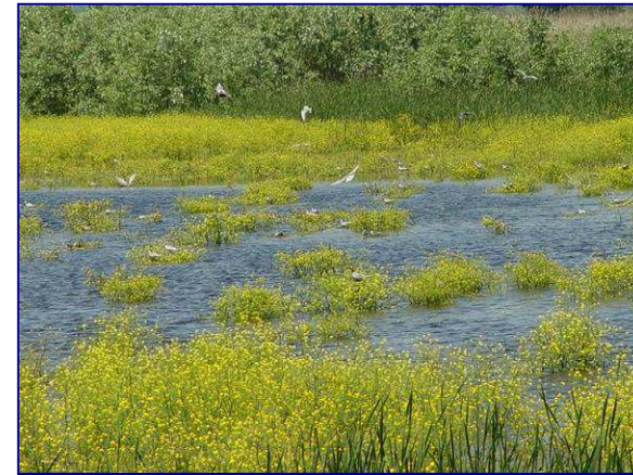
Protected place Kalimok- Brashlen