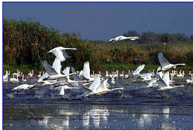
Lake Srebarna (Siver lake)